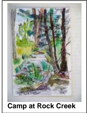
Camp at Rock Creek

Two passions met on a summer back pack trip: art and hiking. Yes, of course there were many photos, almost 2000. Naturally I kept a journal, a full pocket notebook. But more was needed to record this adventure---trail side sketches, some with water color washes. I'm not normally a water colorist but a fellow artist who is helped me put together a small light weight kit. An Altoid tin held tiny trays of paint, a water filled brush, and a pack of 4x6 water color post cards and a Micron pen, rubber banded together made up the kit. Weariness and miles to keep limited the time for sketching. I found that the ink drawing could be done rapidly. My attention was sharply focused as I recorded a scene's contours .Details not otherwise noticed emerged. A quick wash of color and I had an in situ impression of my experience that had freshness and immediacy to bring back memories later that with the aid of photos and journal could be done larger and more finished in the studio while still carrying for me the feel of the air and aromas of nature as well as my feelings. I noticed how quickly my drawing skills were re-established. These sketch breaks were relaxing amid the stresses of a back pack. I wish there had been time for more. I am continuing to do these little quick sketches. I now have several in HAA's gallery. More than my many photos these take me directly back into the experience. It was a great venture that was enriched in doing these little drawings.