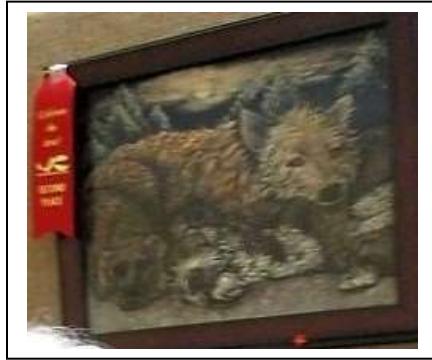
'Three Dog Night' –black board scratch art by Trilby A.